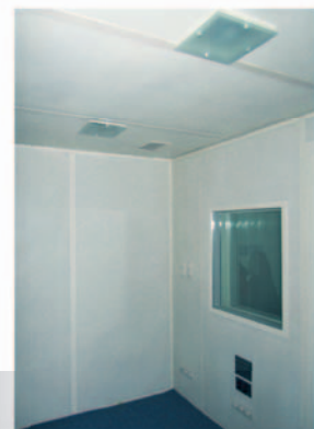
Internal view in perforated steel