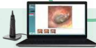
Viot™ Video otoscope