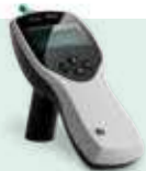
MT10 Handheld tympanometer